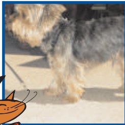
Levi Strike a Pose!