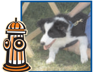
Fallan Border Collie Puppy