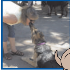
Beeble Giving Kisses