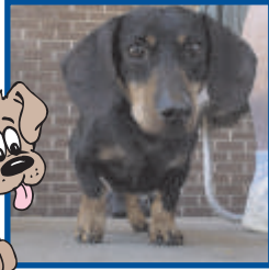
Willie Hot Dog – A Picture!