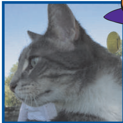
Dino The Cat that Thinks He's a Dog! He walks on a leash and loves to ride in a car.