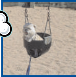
Wrangler Swinging Anyone?