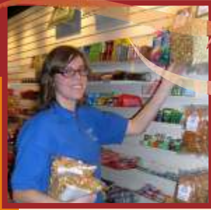
Each year, volunteers provide an average of 32,000 hours in various areas throughout the hospital.

Volunteers play a key role in the healing presence and culture at Saint Joseph Hospital. Since 1955, our Volunteers have dedicated countless hours of service to patients and their families. Most Volunteers work an average of four hours per week. As a Volunteer, you have the possibility to serve, grow, learn, make new friends, exchange ideas and contribute to your community.